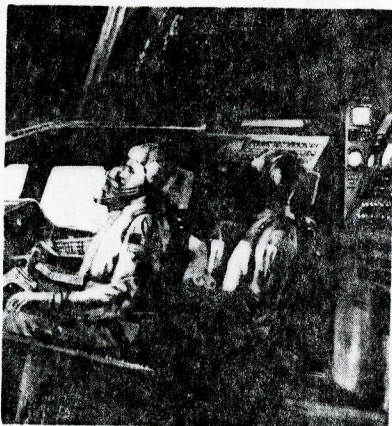
FIRST GROUP OF 20 REPORTS TO JSC ON AUGUST 2, 1977